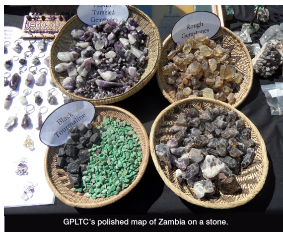
GPLTC's polished map of Zambia on a stone.

Furthermore, TEVETA collaborates with the industry to identify and reduce shortages of skills in various areas of the economy, which impact negatively on productivity and economic competitiveness. The Authority works together with the industry on devising TEVET delivery systems and mechanisms that facilitate recognition of different forms