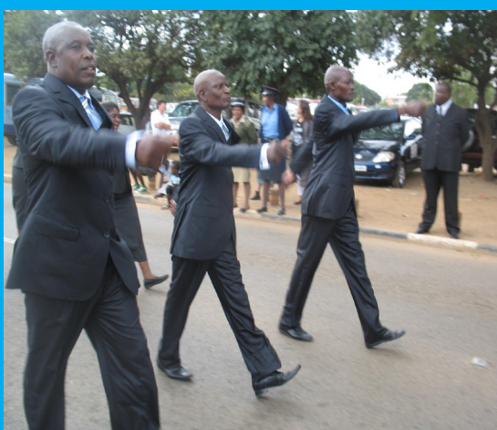
Stand at ease! Quick, match!! TEVETA staff matching during the 2011 Labour Day Celebration in Lusaka.