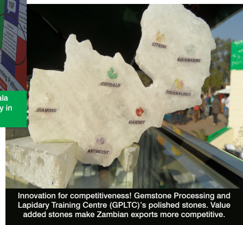
Innovation for competitiveness! Gemstone Processing and Lapidary Training Centre (GPLTC)'s polished stones. Value added stones make Zambian exports more competitive.

To improve the quality of technical and vocational education and training, and increase access to training, TEVETA has devised