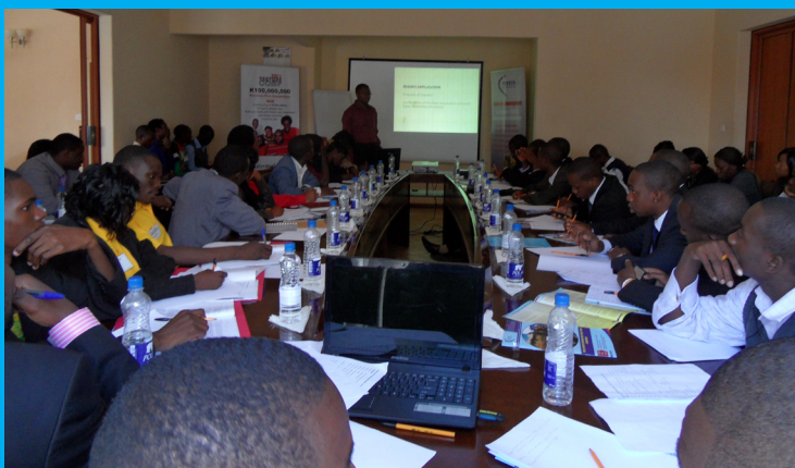
Some VentureComp 2011 participants paying attention to business tips during the mentorship workshop. The mentorship workshop drew professions from finance, supply chain, stock market, marketing and business backgrounds