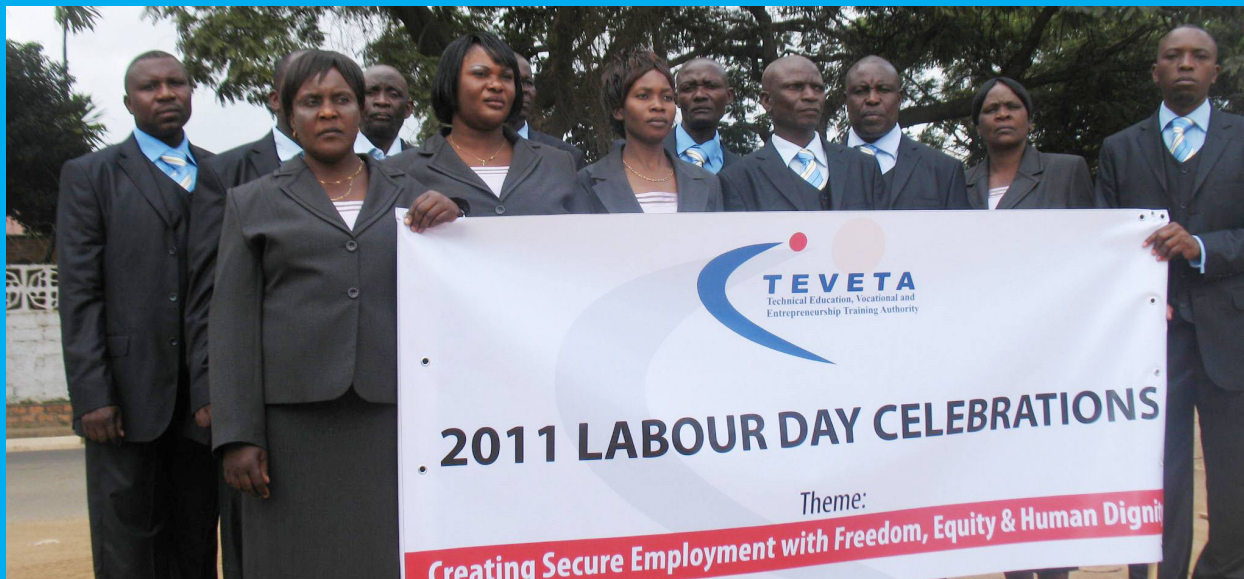
TEVETA staff pose for a photo after matching for the creation of secure employment with freedom, equity and human dignity.